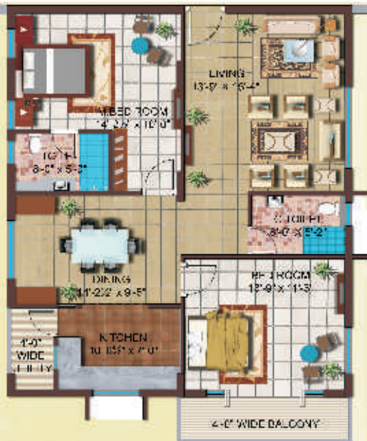
Model - 3 FLATS 2 BHK Total Area: 1271.00 sft