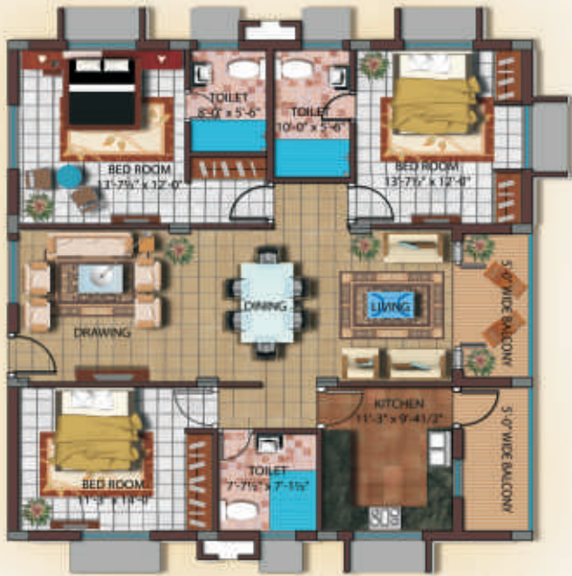
Model - 1 FLATS 3 BHK Total Area: 1775.00 sft