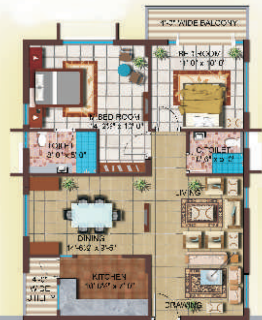
Model - 4 FLATS 2 BHK Total Area: 1155.00 sft