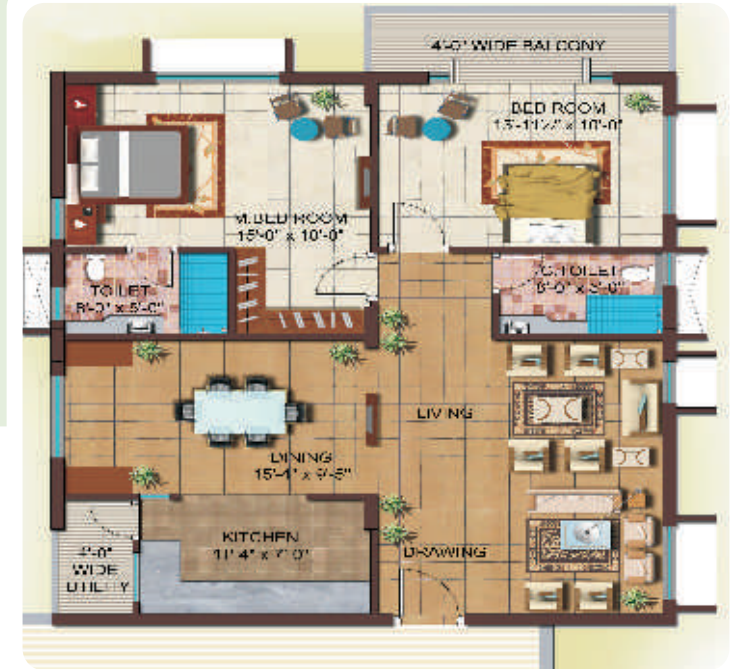
Model - 2 FLATS 2 BHK Total Area: 1325.00 sft